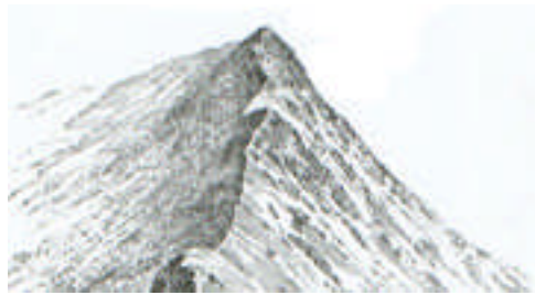
Stybarrow Dodd – Alfred Wainwright

Before setting out ensure you are prepared and check the forecast!