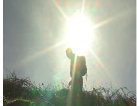
Fred - following in the footsteps of AW

For further information on walks in your area, what to do, see and enjoy visit www.countrysideaccess.gov.uk